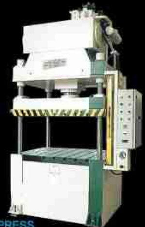
■ 4 POST TYPE PRESS