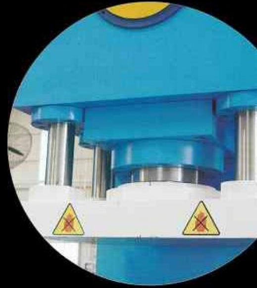
■ GAP TYPE