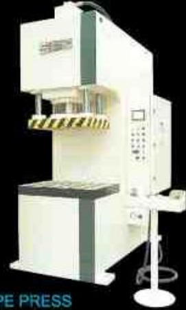
■ GAP TYPE PRESS